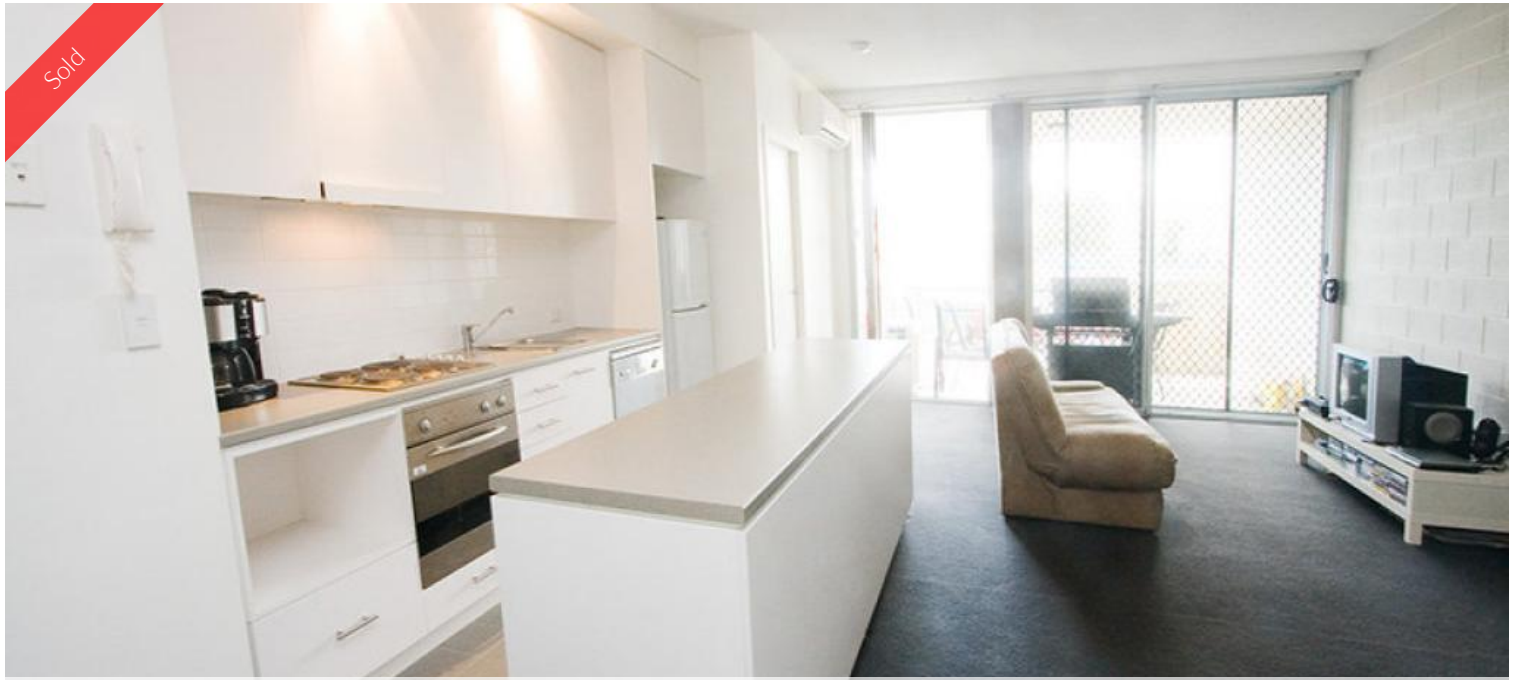
28 Masters Street, Newstead