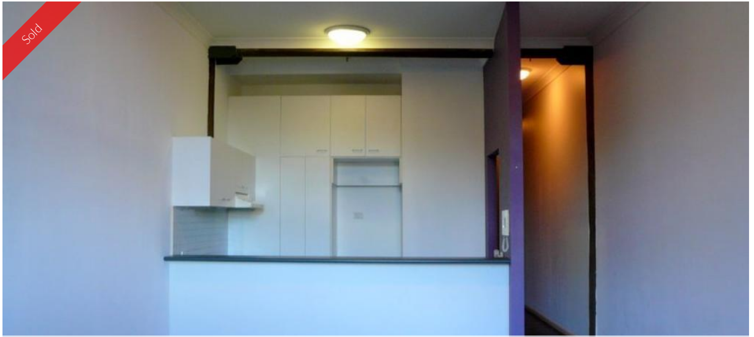
241 Arthur Street, Teneriffe