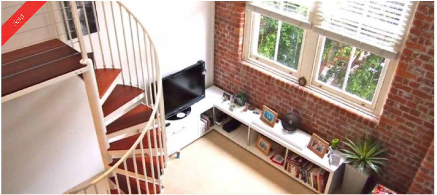
Sold 53 Vernon Terrace, Teneriffe