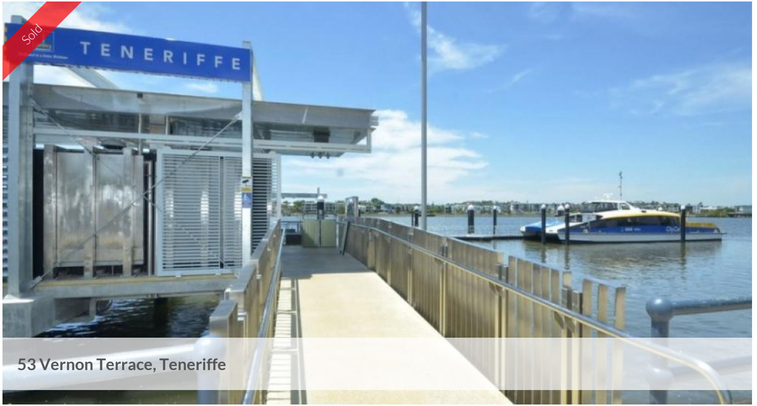
53 Vernon Terrace, Teneriffe