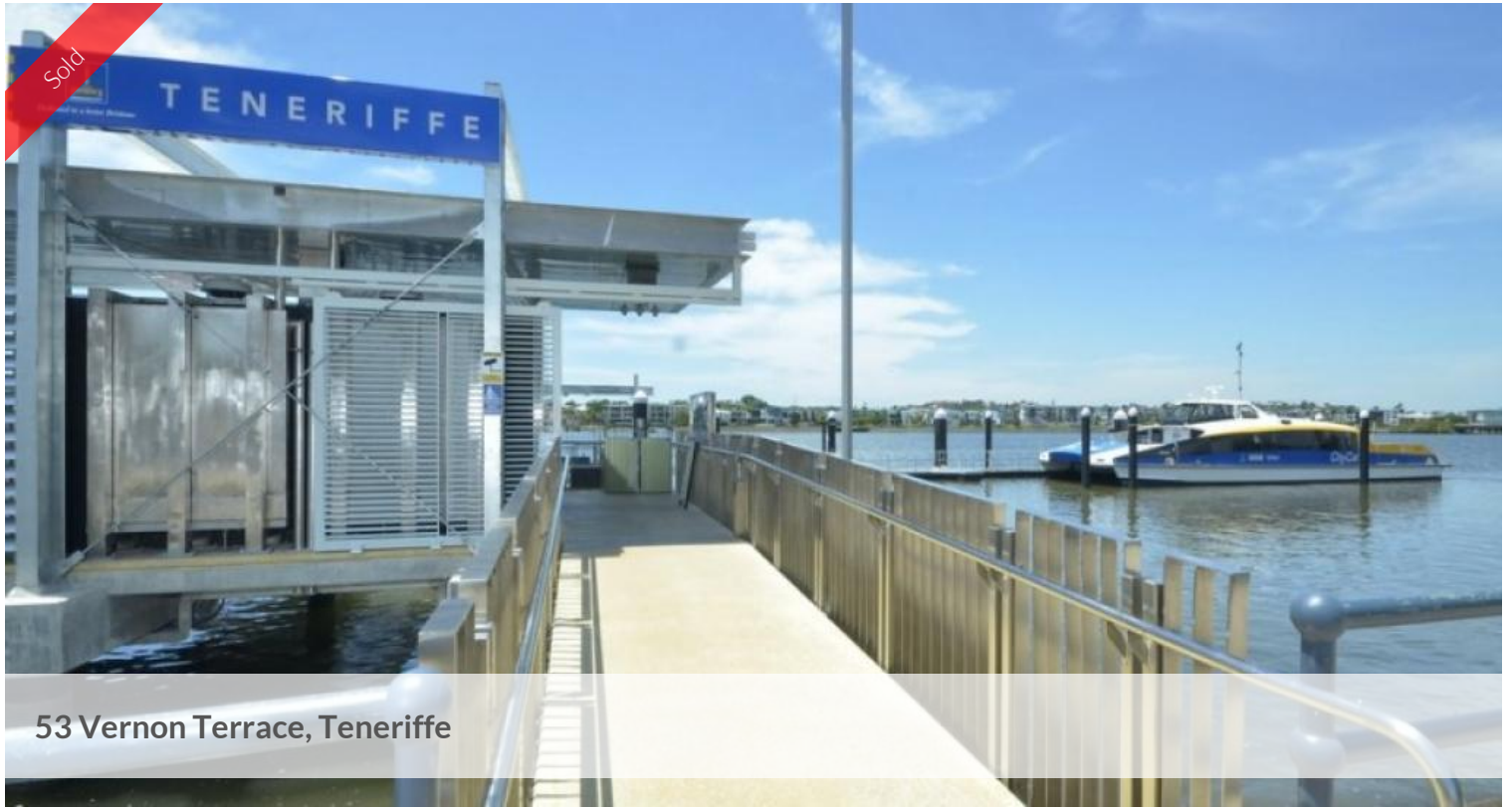
53 Vernon Terrace, Teneriffe