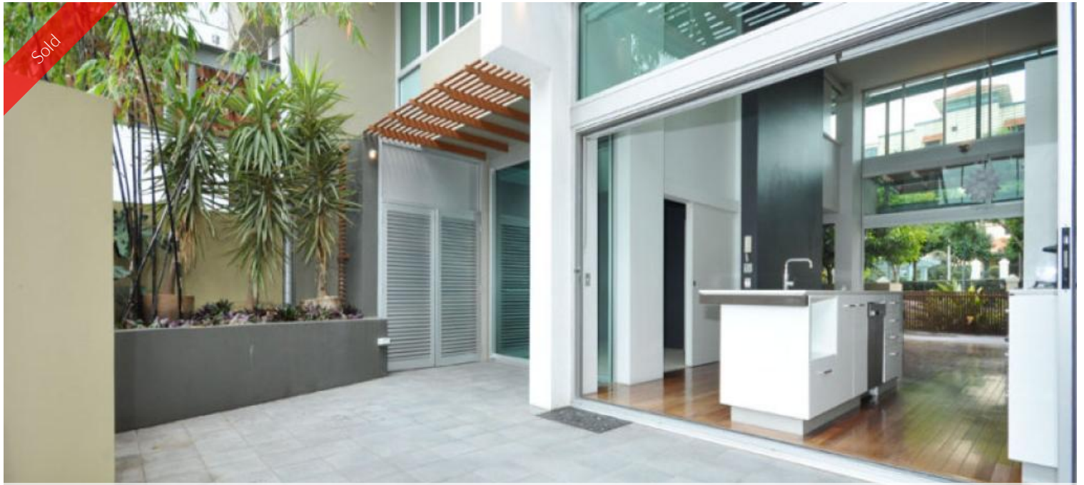
20 Newstead Terrace, Newstead