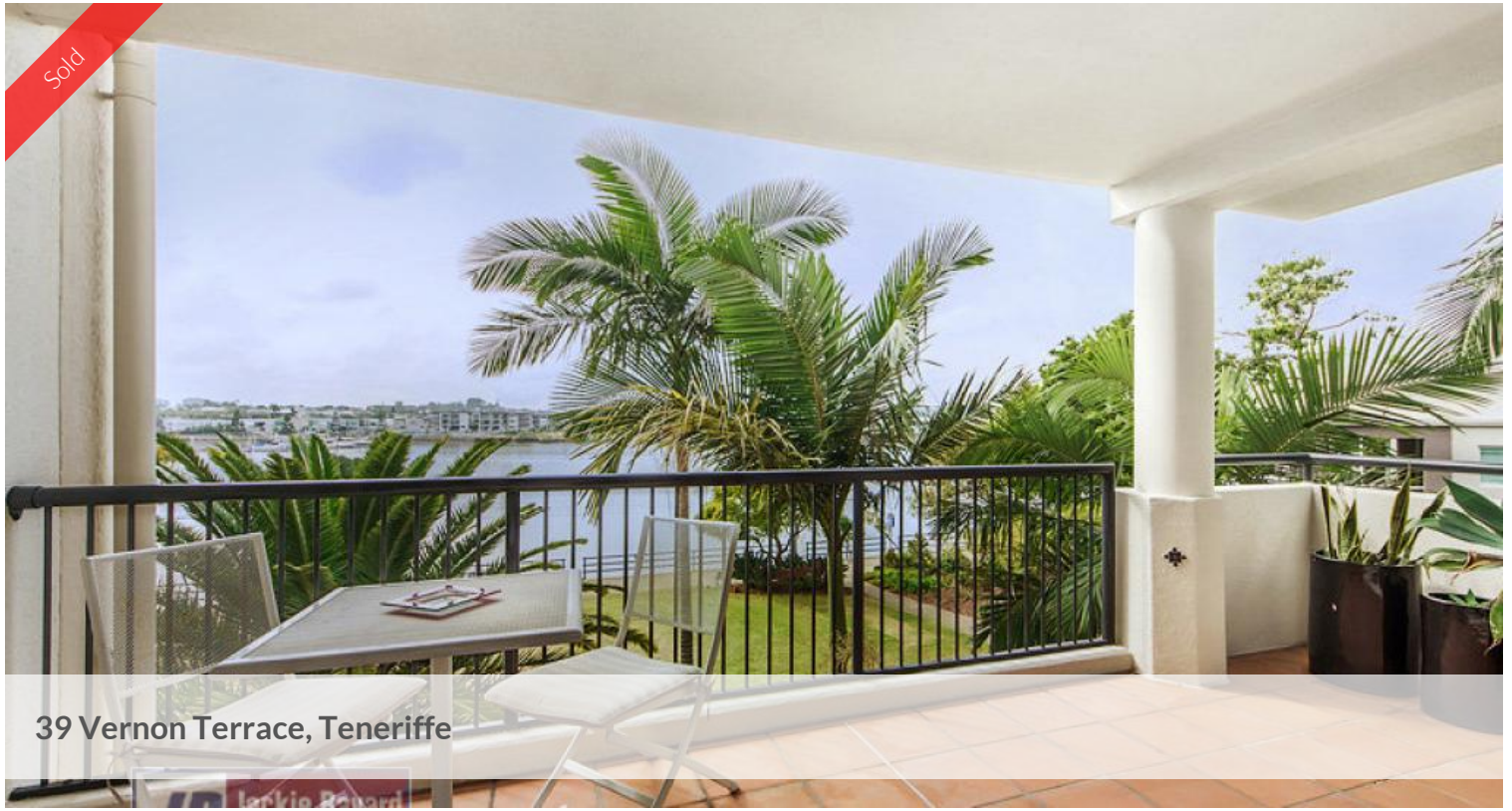
39 Vernon Terrace, Teneriffe