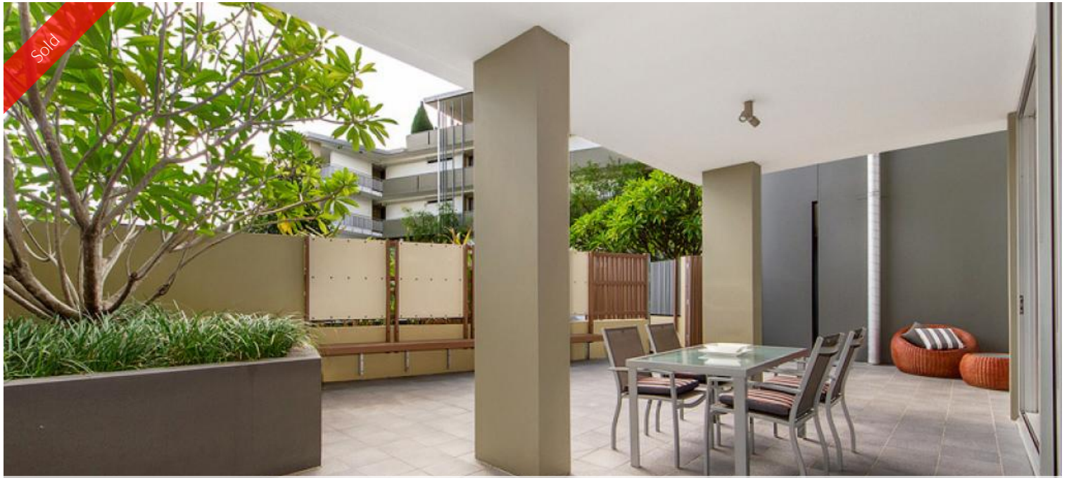
Unit 9, 20 Newstead Tce, Newstead