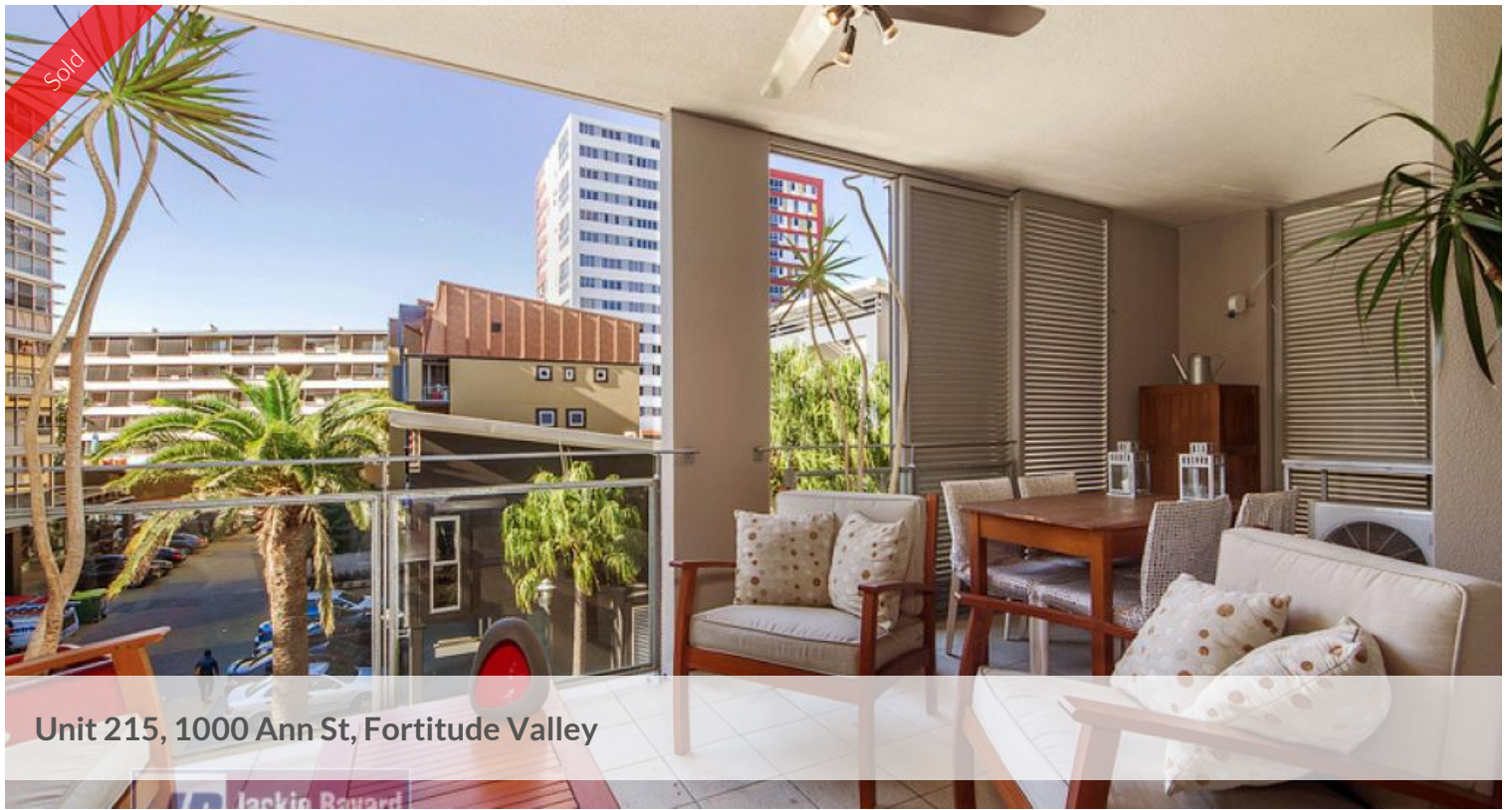
Unit 215, 1000 Ann St, Fortitude Valley