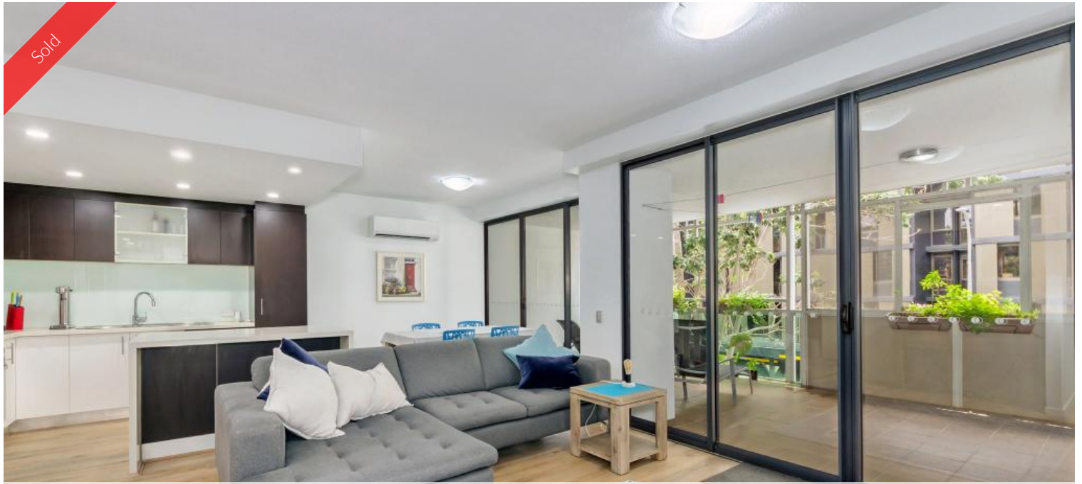
Unit 7, 110 Commercial Rd, Teneriffe