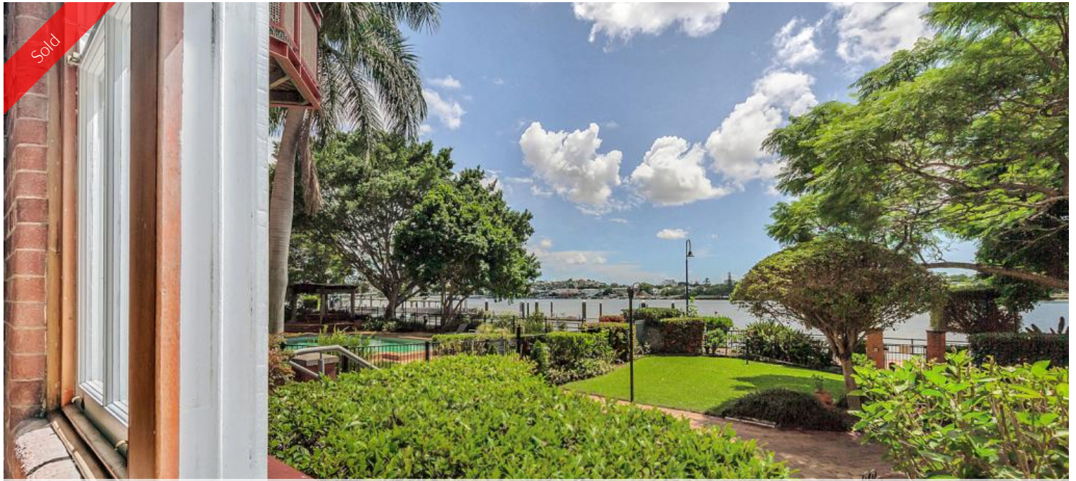
Unit 15, 53 Vernon Tce, Teneriffe