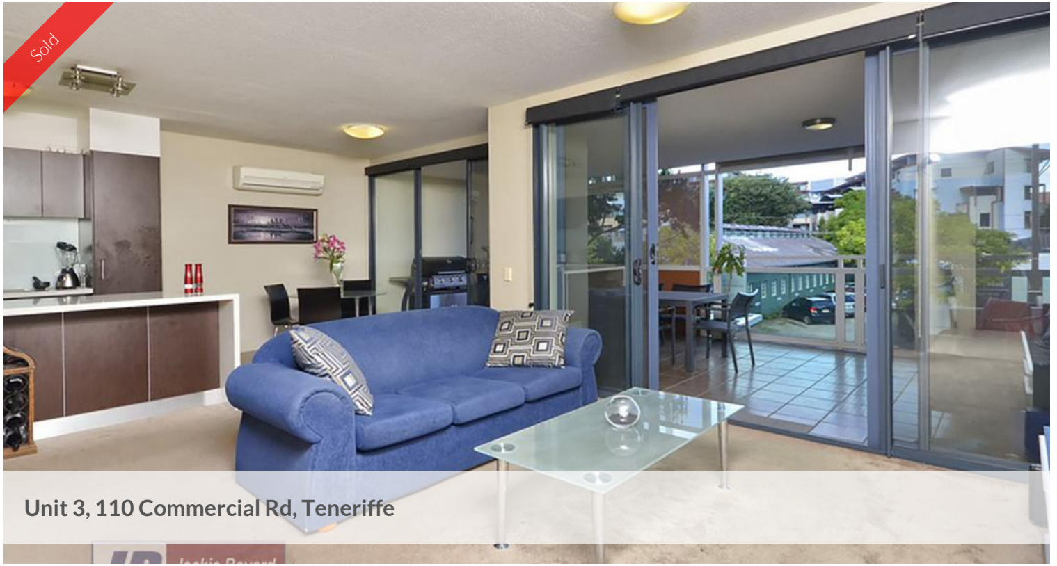
Unit 3, 110 Commercial Rd, Teneriffe