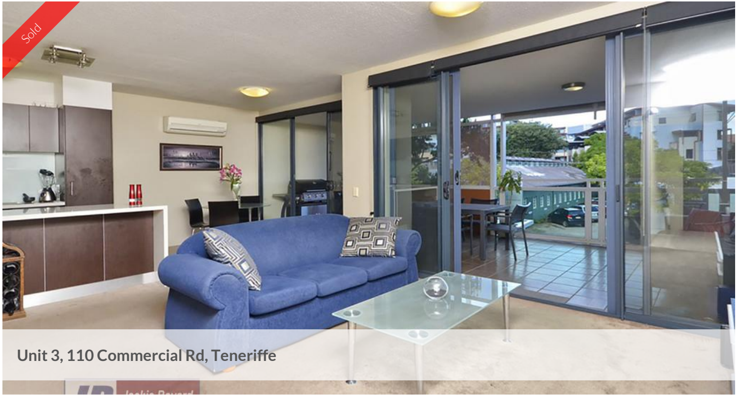
Unit 3, 110 Commercial Rd, Teneriffe